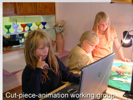
Cut-piece-animation working group.

An animation film comes into existence with the camera, an editing workstation and with the imagination.